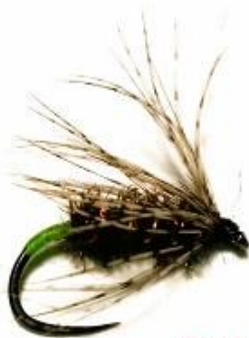
Peacock & Partridge Tied by Paul Dinice http://tightlinesflyfishing.blogspot.com/

https://www.youtube.com/watch?v=_KvALYNOA6Q