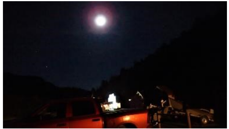
Salmon River the fall, below that same river this past summer