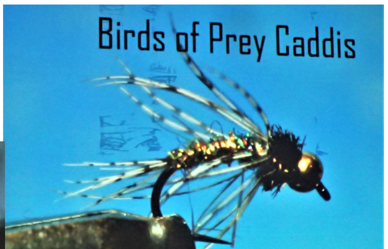
Birds of Prey Caddis