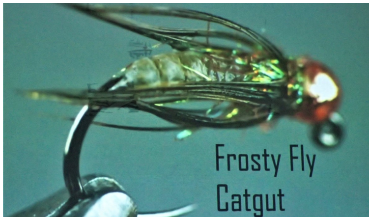
Frosty Fly Catgut