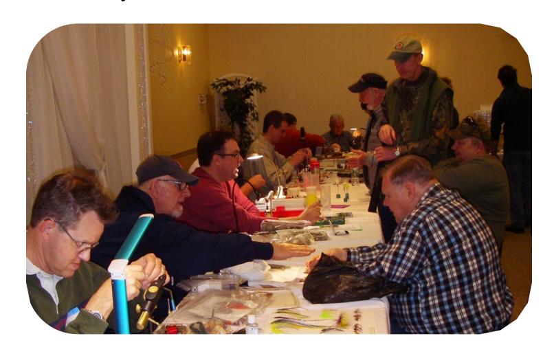
Fly tiers giving pointers for the "right" fly that's sure to work!