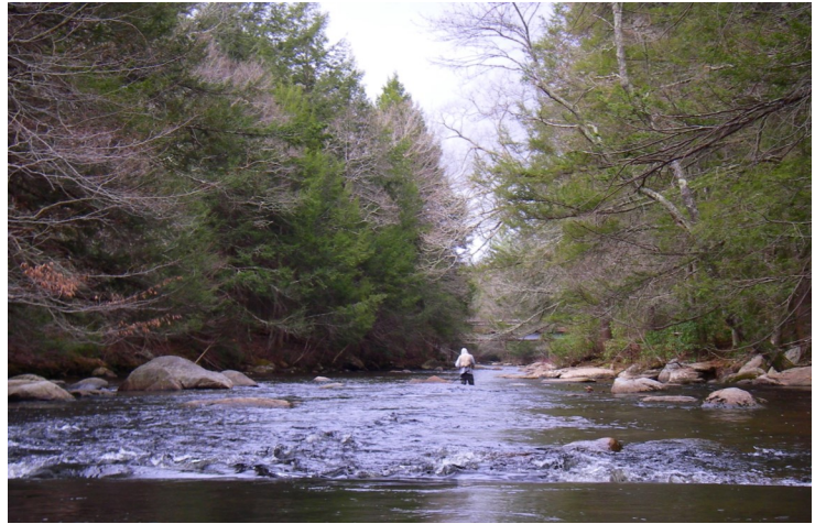
Natchaug River In April, Hendrickson time