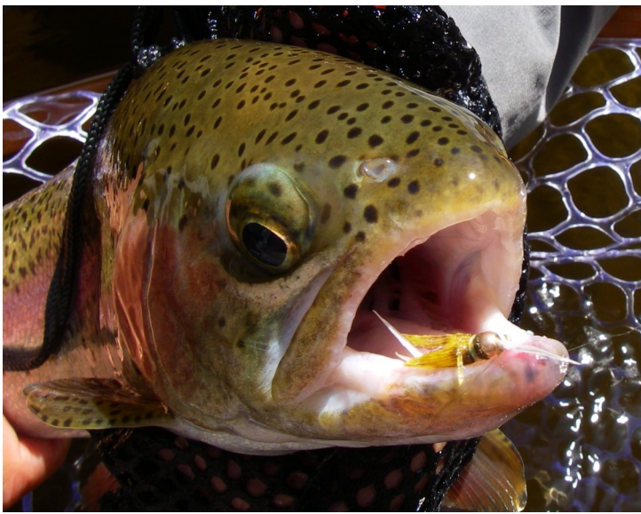
Ravin Fork bow on a yellow stone fly