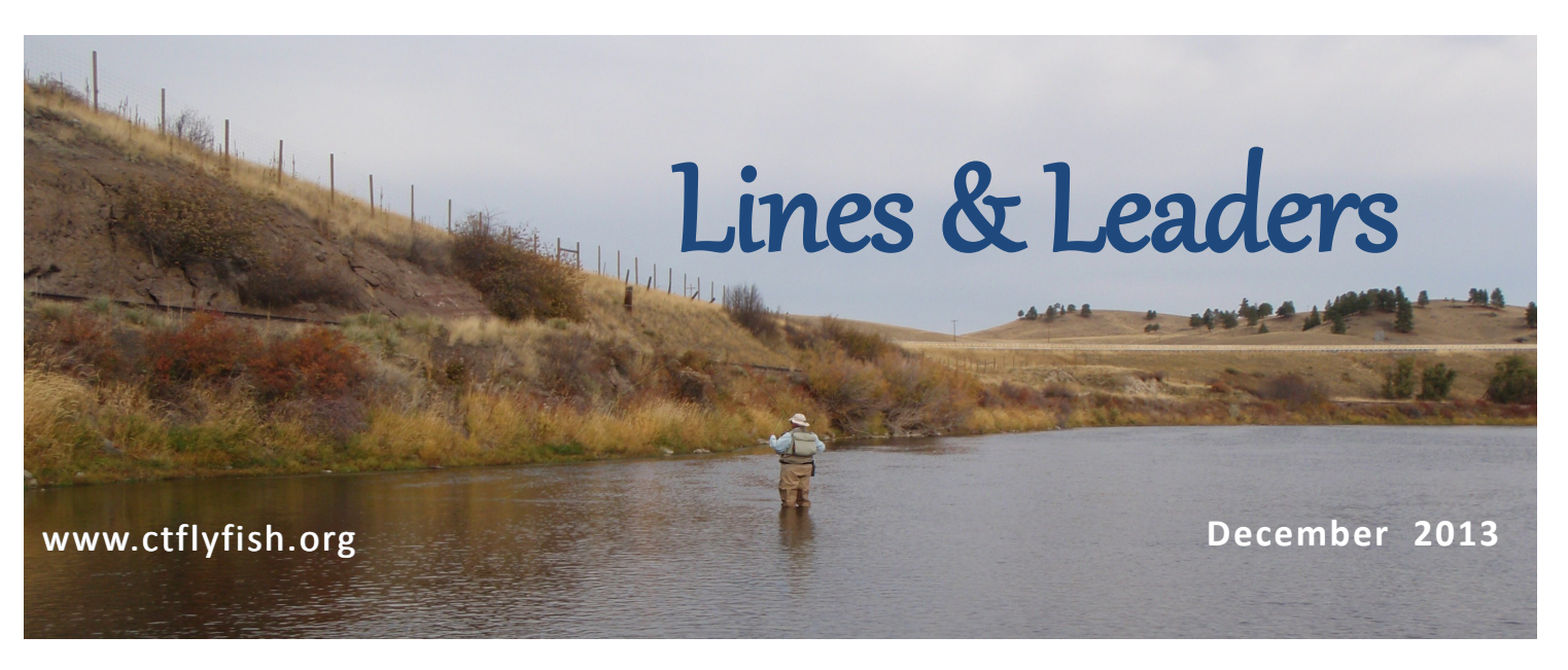
The Newsletter of The Connecticut Fly Fisherman's Association