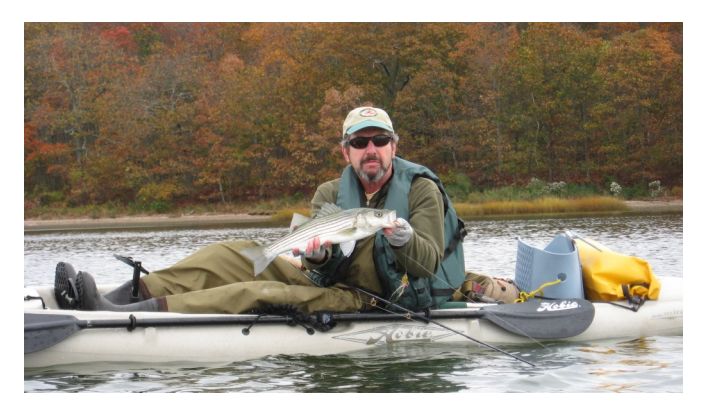
"The great charm of fly-fishing is that we are always learning." Theodore Gordon