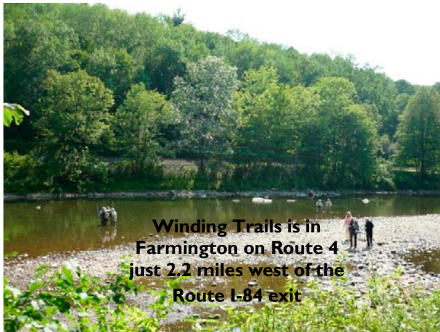
Winding Trails is in Farmington on Route 4 just 2.2 miles west of the Route 1-84 exit

Spend an afternoon at Farmington’s Winding Trails getting to know the soothing pursuit of fly fishing and the art of fly tying. Wander its picturesque trails and enjoy the scenery.