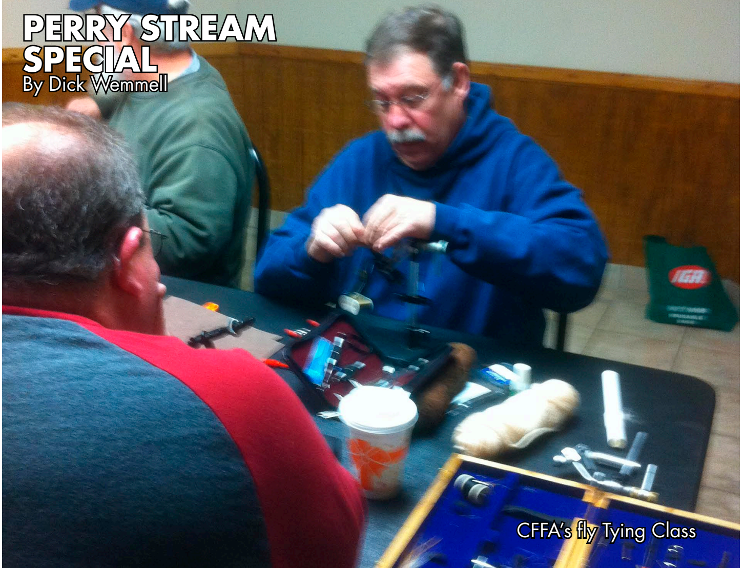
CFFA's fly Tying Class