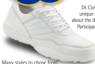
Many styles to chose from

Dr. Comfort "extra depth" shoes are specially designed for the unique needs of the diabetic patient. Ask your podiatrist today about the difference Dr. Comfort shoes can make to your health! Participating in Most Health Plans. Now available exclusively at: