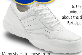
Many styles to chose from

Dr. Comfort "extra depth" shoes are specially designed for the unique needs of the diabetic patient. Ask your podiatrist today about the difference Dr. Comfort shoes can make to your health! Participating in Most Health Plans. Now available exclusively at: