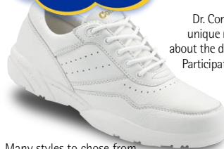
Many styles to chose from

Dr. Comfort "extra depth" shoes are specially designed for the unique needs of the diabetic patient. Ask your podiatrist today about the difference Dr. Comfort shoes can make to your health! Participating in Most Health Plans. Now available exclusively at: